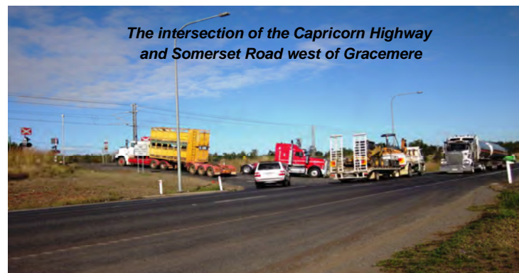
The intersection of the Capricorn Highway and Somerset Road west of Gracemere

Following the announcement of the overpass location, the department expects to complete all planning and design activities associated with project by July 2011.