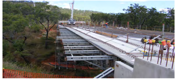
Calliope Range Realignment

More than 50% of earthworks associated with the Calliope Range realignment is complete. Lane/speed restrictions remain in place to ensure the safety of motorists and construction workers.